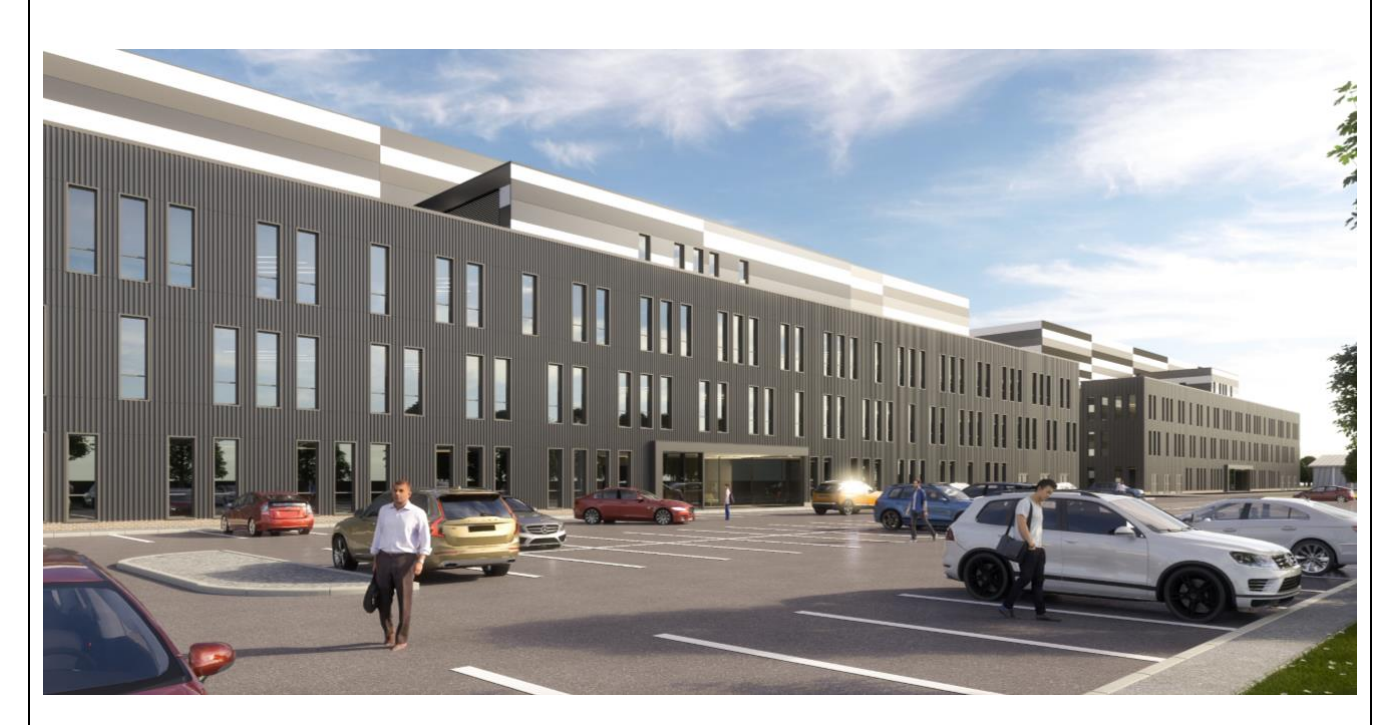
Characteristics of the Site and Area